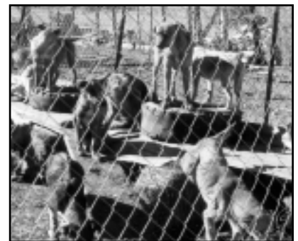
Animals kept in hoarding situations often live their entire lives in crowded, miserable conditions.